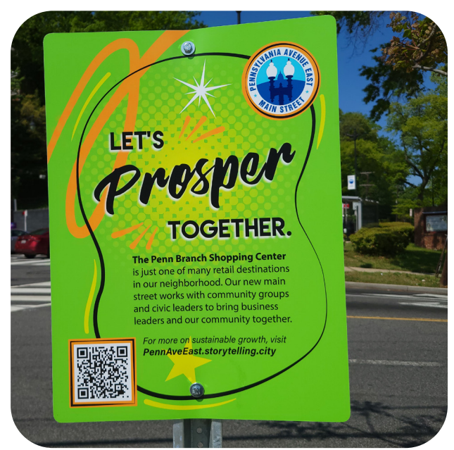
Pennsylvania Avenue East Main Street Initiative

Collectively, the recommendations around each theme establish a framework that will support a thriving commercial main street where all residents can live, work, eat, and play. Through the implementation of this plan, residents will see increased investments in inclusive resources and neighborhood amenities. Future private redevelopment and zoning changes will also be guided by recommendations in this Small Area Plan, which emphasizes increased housing opportunities and neighborhood amenities.